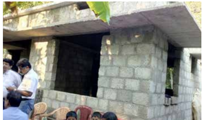
House construction under Progress at Udayamperoor by Cochin Millennium club district -IV