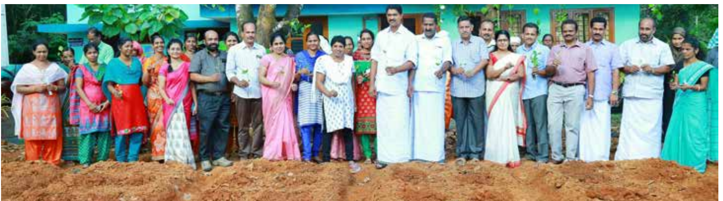
Organic Farming at Ayavana Govt. Hospital by Pineapple City and District -IX