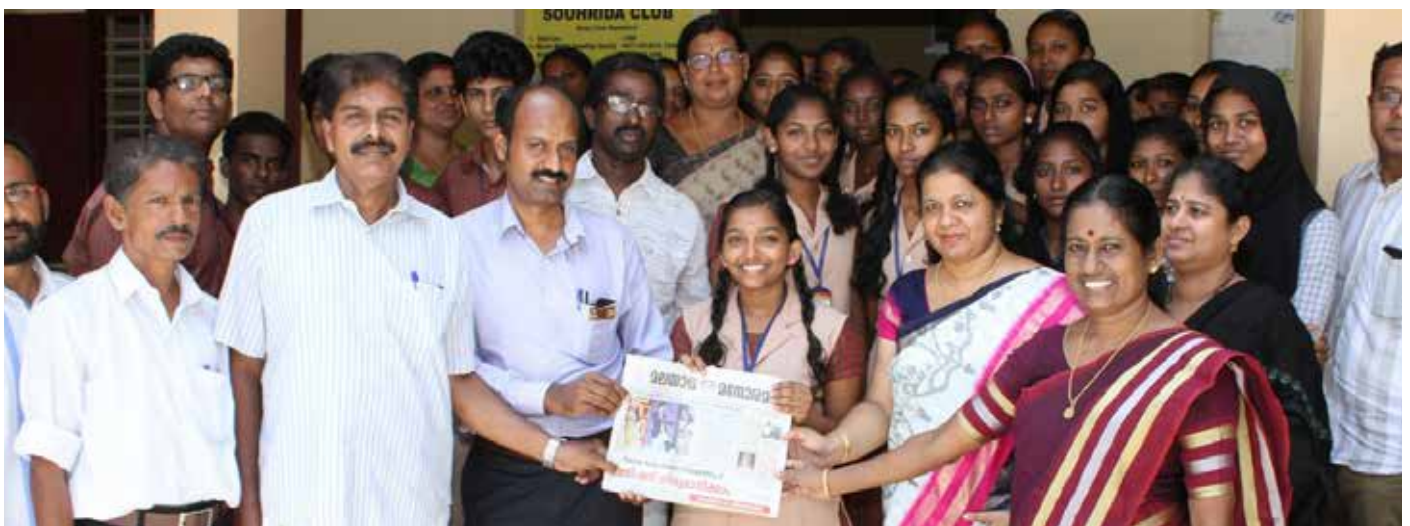
News Paper distribution at S.N.D.P School, Palluruthy by Cochin Corals of district -III