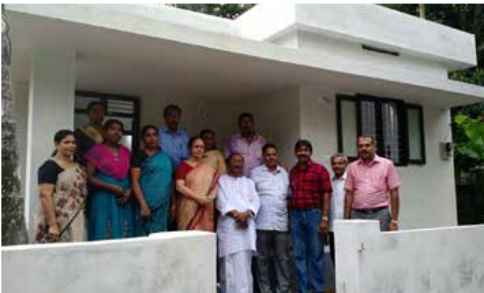
Handing over the key of house constructed by Perumbavoor Central club, district - XIV at Kanjirakkad