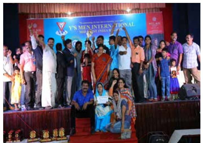
District 1 - Over all Champion