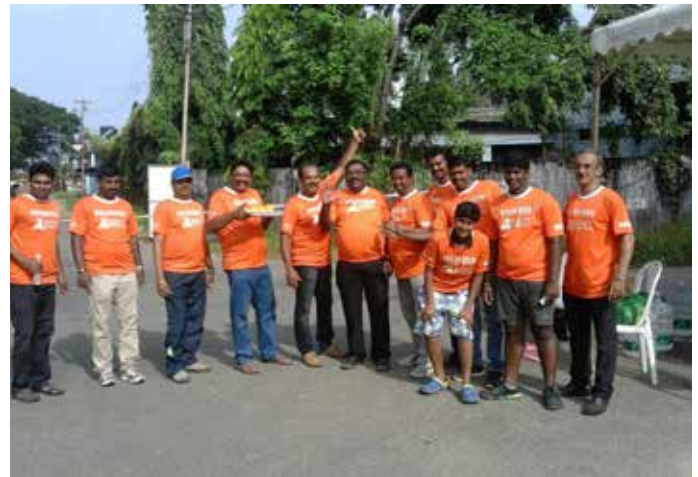
Y's Men Volunteers