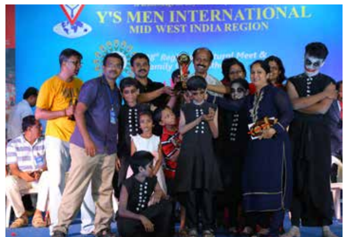
Cochin East Club - Over all Champion