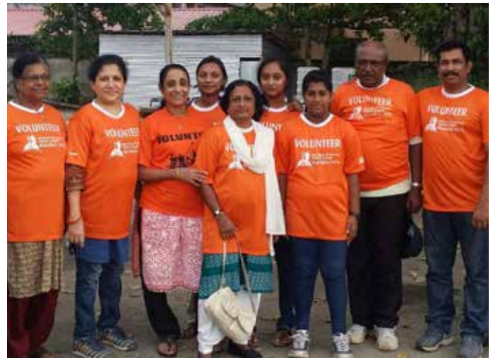
Y's Men Volunteers